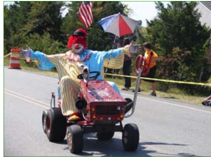
The Old Timers’ Day parade is a popular attraction for residents and out-of-towners.

Emissions Information, 399-8995 Driver’s License, 898-8037 Rutherford Co. Health Dept., 355-6175 Post Office, 793-3806 Chipper Service, 793-9891