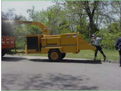
The City-owned chipper will come to your home to chip branches and more. Call Public Works to schedule a time.