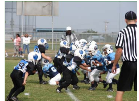
Youth programs are popular at both Veteran's Memorial Park and the La Vergne Library.