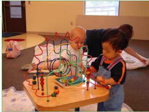
La Vergne children play while they listen to readers during the Library's Babies and Books.