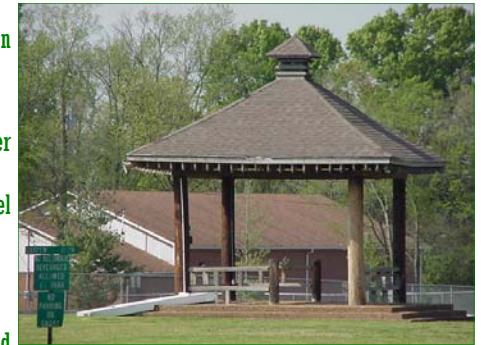
La Vergne offers a small town feel with big city amenities.