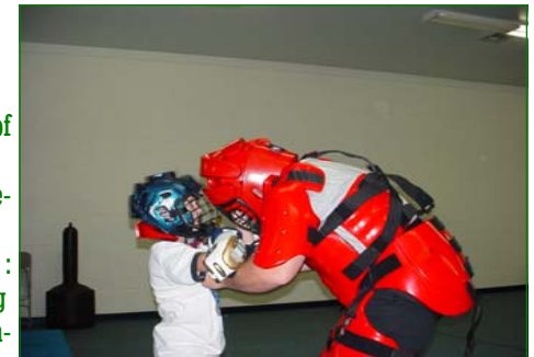
radKids safety program for kids is just one of the activities offered by the local PAL program.