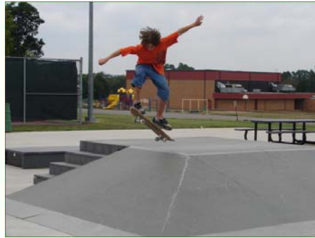
The popular skate park opened in the spring of 2006.